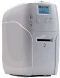
Single-Sided Manual Feeding