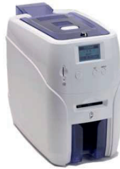
Single-Sided Manual Feeding Card Stacker Dual Sided (Optional)